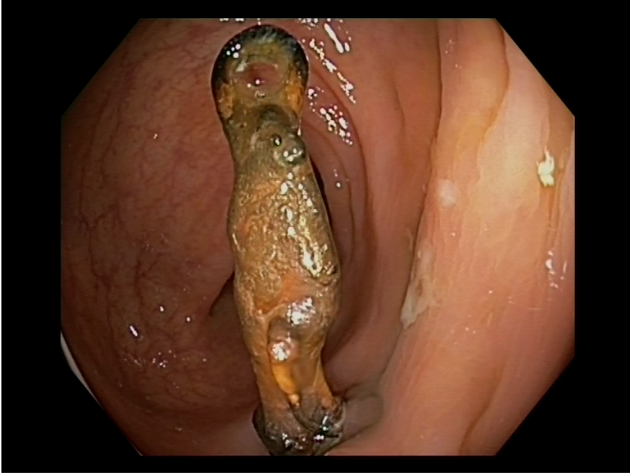
Fig. 1. Intrauterine device penetrating the transverse colon.