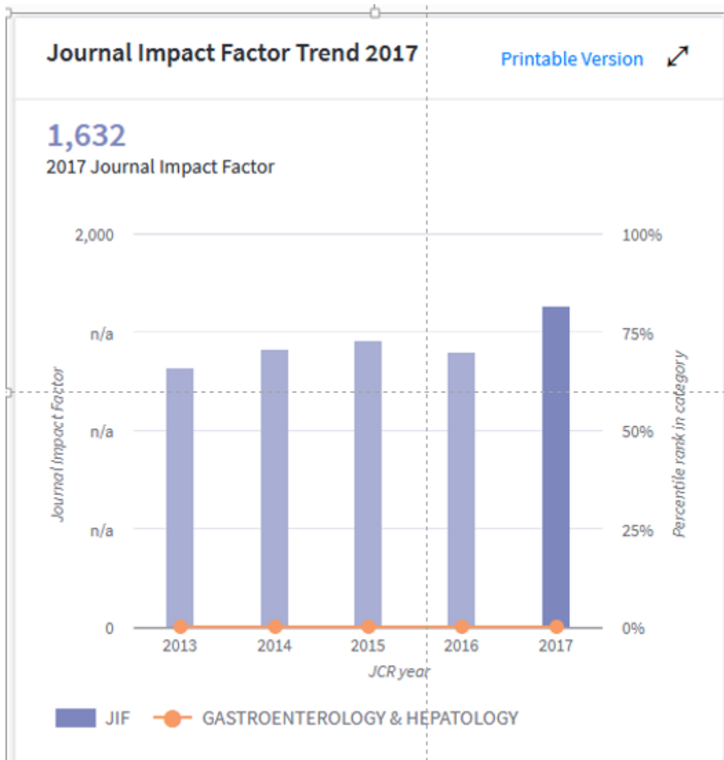
Fig. 2. Journal impact factor trend in 2017.