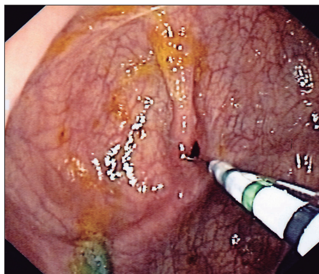
Fig. 2. Section of the strictured ureterosigmoidostomy with a conventional sphincterotome.

A 47-year-old male diagnosed with bladder adenocarcinoma was treated with intestinal bypass, Mainz II type. During a subsequent colonoscopy, two sessile polypoid lesions were excised, which were eventually identified as ureterosigmoidostomy-related granulomas. Follow-up revealed a ureteral dilation and anastomotic stricture in the left ureter secondary to “polypectomy”-associated scarring. Radio-guided surgery using a combined urologic-endoscopic approach was selected for treatment. A radiopaque guidewire was passed via a left nephros-