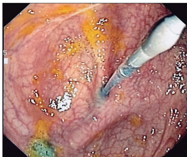
Fig. 1. Balloon dilation with a radiopaque guide wire through a left ureterosigmoidectomy stricture.